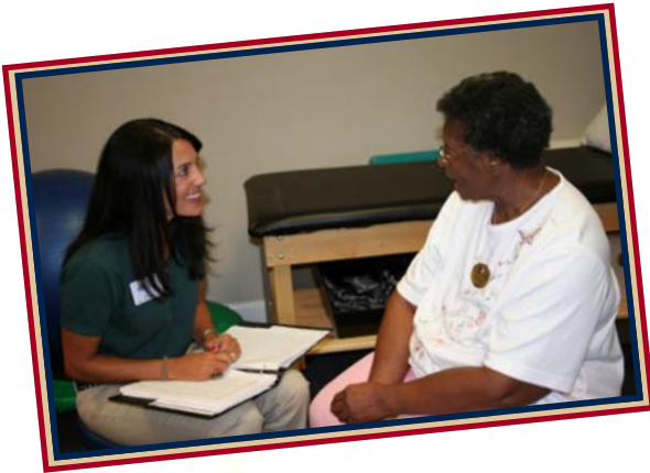
A TLC therapist works with a resident.

The Hawthorn House's memory support wing is now open thanks to our many donors who helped to make the service a reality. Improvements such as new furniture, enclosed kitchen areas and a new resident monitoring system were completed in July. Additional staff was hired to work in the memory support wing including an activities