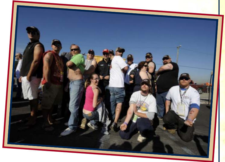
Jeremiah Weed dared NASCAR fans to get a free on-the-spot tattoo at the Talladega Superspeedway. Jeremiah Weed pledged $100 per tattoo to AFEV. Seventeen people received free tattoos and Jeremiah Weed donated $5000 to AFEV.