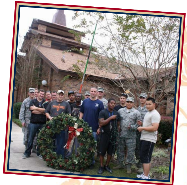
Members of Eglin AFB's 16th EWS and the 28th TES volunteered their time and hung Christmas decorations on the Bob Hope Village campus.